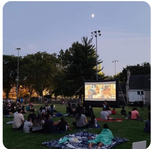
NEWARK SUMMER FUN