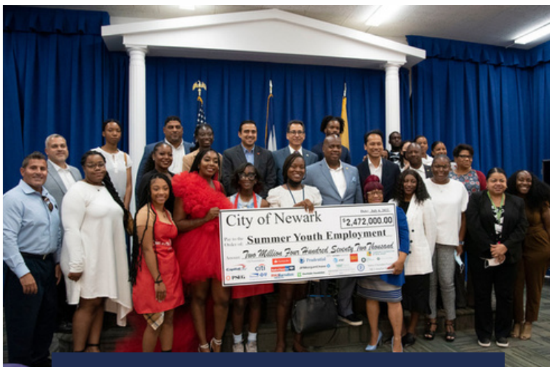
SYEP 2022 PRESS RELEASE EVENT