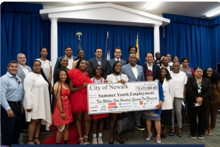
SYEP 2022 PRESS RELEASE EVENT