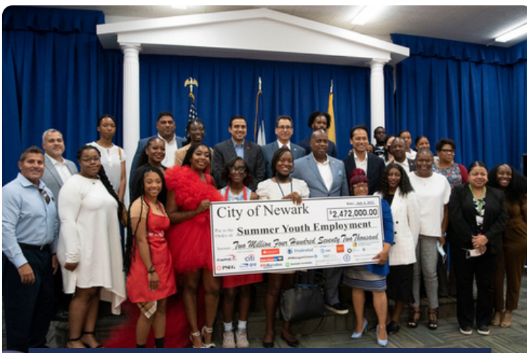
SYEP 2022 PRESS RELEASE EVENT