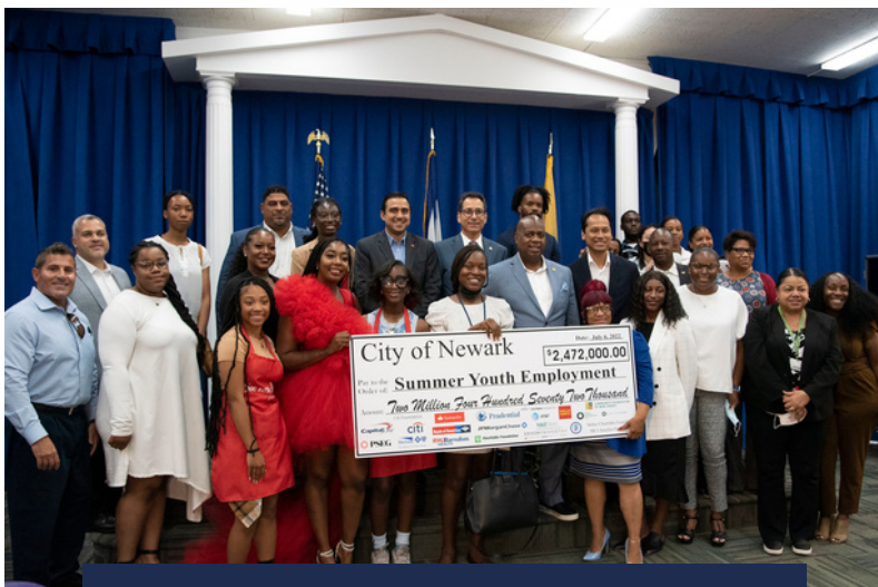
SYEP 2022 PRESS RELEASE EVENT