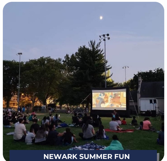
NEWARK SUMMER FUN

The City Parks Foundation completed its first full year of existence in 2022. This new entity facilitates the strategic management of Newark's five downtown parks to ensure alignment of programming and services. In addition to creating cultural, educational, and recreational events, the Foundation also prioritizes access for all residents and works closely with the Department of Recreation, Senior Services, and Cultural Affairs to ensure thriving parks. The NPL supported the Foundation's organizational and fund development, and identified nearly $400,000 in private funds in the first two years of the foundation's existence to supplement a large city investment. The City Parks Foundation serves as a critical partner for Summer Fun, a holistic effort to provide enrichment and educational opportunities throughout the city for our youth in the summer months, a time when crime is at risk of increasing.