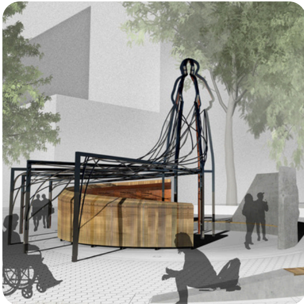
TUBMAN MONUMENT RENDERING

The year 2022 was in many ways a year of realization. The groundwork laid in previous years for initiatives of tremendous import in economic security, neighborhood development strategy, and arts and culture enabled a year of progress and impact. This was only possible through effective and highly collaborative public-private partnerships that leveraged the talent, expertise, and resources of government, foundations, and the nonprofit community. Thanks to the longstanding commitment of the Council of New Jersey Grantmakers and local foundations, our recognition as a national model for collaboration continues, with new interest in the Liaison's role from organizations and cities around the country. Though we achieved many successes in 2022, the following pages detail our proudest accomplishments.