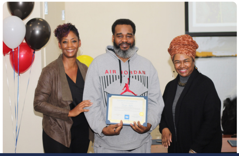
NEWARK MOVEMENT FOR ECONOMIC EQUITY