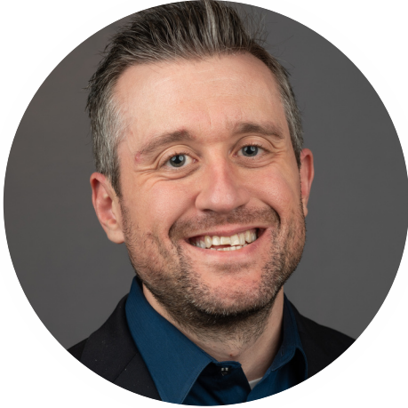
NEWARK PHILANTHROPIC LIAISON