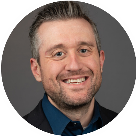
NEWARK PHILANTHROPIC LIAISON