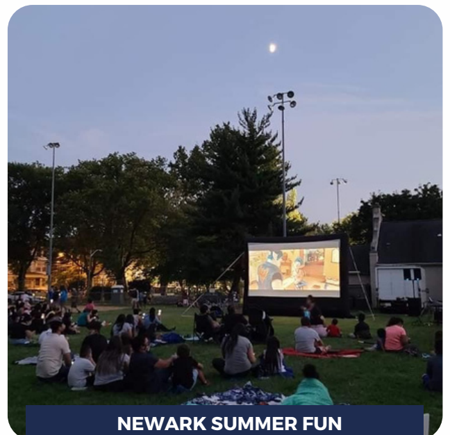
NEWARK SUMMER FUN

The City Parks Foundation completed its first full year of existence in 2022. This new entity facilitates the strategic management of Newark's five downtown parks to ensure alignment of programming and services. In addition to creating cultural, educational, and recreational events, the Foundation also prioritizes access for all residents and works closely with the Department of Recreation, Senior Services, and Cultural Affairs to ensure thriving parks. The NPL supported the Foundation's organizational and fund development and identified nearly $400,000 in private funds in the first two years of the foundation's existence to supplement a large city investment. The City Parks Foundation serves as a critical partner for Summer Fun, a holistic effort to provide enrichment and educational opportunities throughout the city for our youth in the summer months, a time when crime is at risk of increasing.