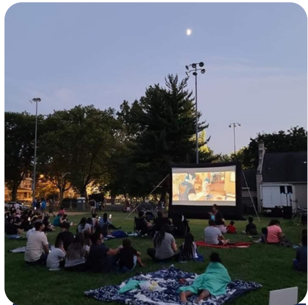
NEWARK SUMMER FUN