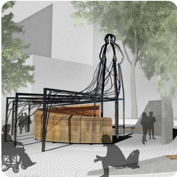
TUBMAN MONUMENT RENDERING

The year 2022 was in many ways a year of realization. The groundwork laid in previous years for initiatives of tremendous import in economic security, neighborhood development strategy, and arts and culture enabled a year of progress and impact. This was only possible through effective and highly collaborative public-private partnerships that leveraged the talent, expertise, and resources of government, foundations, and the nonprofit community. Thanks to the longstanding commitment of the Council of New Jersey Grantmakers and local foundations, our recognition as a national model for collaboration continues, with new interest in the Liaison's role from organizations and cities around the country. Though we achieved many successes in 2022, the following pages detail our proudest accomplishments.