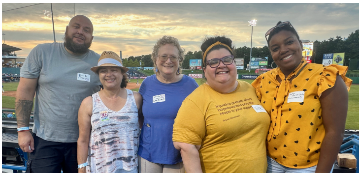
Members at the Jersey Shore BlueClaws for the PEEP Event

In July, CNJG served as the fiscal sponsor for the Monmouth & Ocean County Funder's PEEP Event at the Jersey Shore BlueClaws . PEEP, which stands for Party to Enhance Equity in Philanthropy, is a nationally celebrated movement to bring together nonprofit and philanthropic leaders to help break down the pervasive power dynamics in our work and help us see each other in our full humanity. The family-friendly event was well attended by several members and their families, and it was an excellent opportunity to connect in a relaxed environment. Thank you to the Grunin Foundation for your vision for this program.