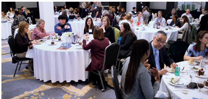
CNJG Members at the 2024 Annual Meeting & Holiday Gathering

The 2024 Annual Meeting & Holiday Gathering , themed Inspiring Change through Leadership: Maximizing Philanthropic Impact , brought together over 130 members on December 14th. Members engaged in a thought-provoking plenary discussion, deepened their knowledge at the Leadership in Action workshop, and enjoyed networking with colleagues.