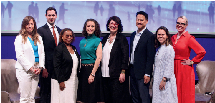
2024 Spring Colloquium for the Social Sector

In August, CNJG and the New Jersey Center for Nonprofits hosted over 150 foundations and nonprofit leaders for the inaugural 2024 Summer Joint Policy Forum: Nonprofit and Philanthropic Champions for New Jersey . This landmark event brought together a diverse group of advocates and changemakers committed to amplifying the impact of nonprofits across the state.