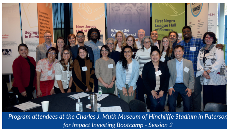
Program attendees at the Charles J. Muth Museum of Hinchliffe Stadium in Paterson for Impact Investing Bootcamp - Session 2

CNJG launched two monthly forums for members. First Fridays for Philanthropy is a new virtual opportunity for members to connect, ask questions, and collaborate on solutions. This initiative has been so well received that CNJG is continuing First Fridays for Philanthropy monthly (except July) at 12 PM on the first Friday of each month throughout 2025. And CNJG CEO to CEO Conversations provides members who are CEOs with a dedicated space for peer-to-peer engagement, sharing challenges, and building relationships.