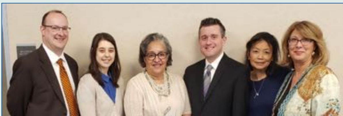
The CNJG team