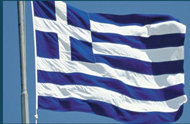
NJ Hellenic American Heritage Commission