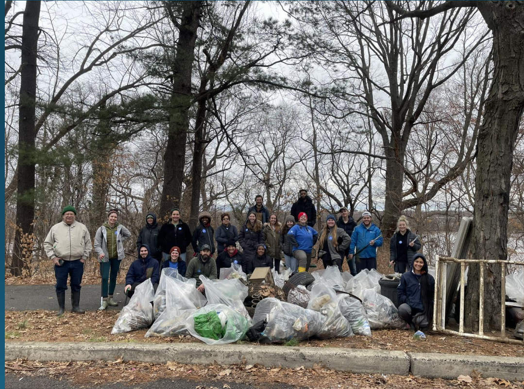
NJDEPWAP River cleanup in January 2023

Funds 20 programs that place 500 members annually in NJ communities to address education, public health, environmental protection, social services, food insecurity, and workforce development.