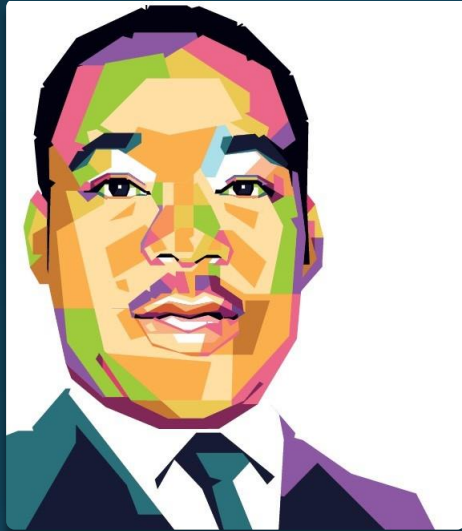
NJ Martin Luther King, Jr. Commemorative Commission