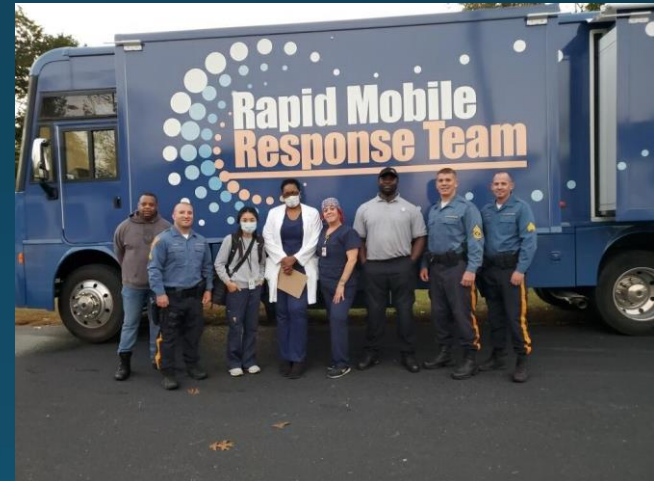
NJ Commission on American Indian Affairs