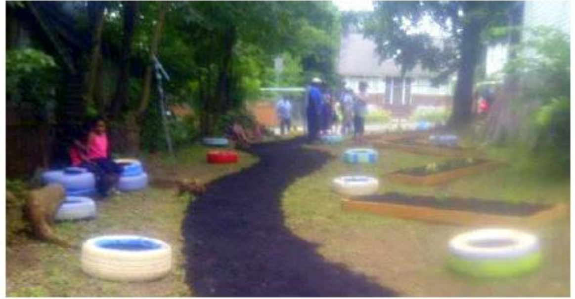
1068 18 th Avenue Newark, NJ 07106

Managing Organizations: Unified Vailsburg Services Organization/Heart of Vailsburg Organizing Project, HOV Block Club Coalition, Vailsburg Garden Committee