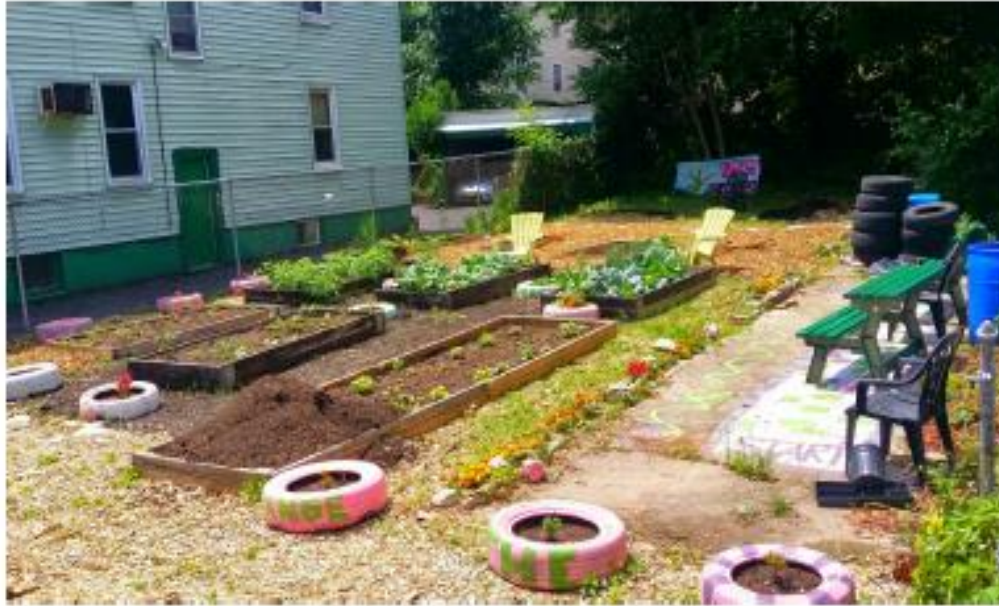
69 Norwood Street Newark, NJ 07106