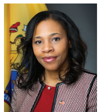
THE HONORABLE TAHESHA WAY Secretary of State State of New Jersey